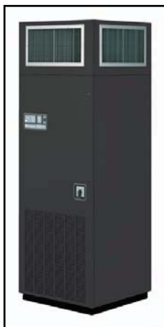
Liebert Challenger Floor Mount System