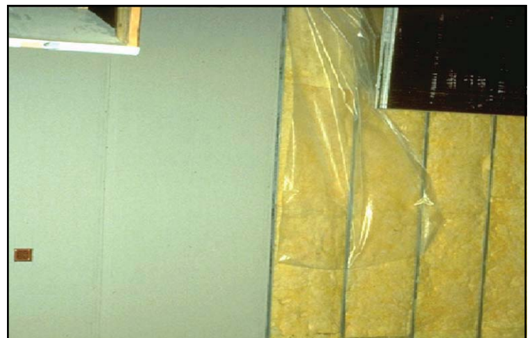
Vapor Barrier Installation

To isolate a given space, the most important piece is providing a vapor barrier. Many materials used as interior coverings for exposed walls, such as dry wall, wood paneling, and plywood, permit water vapor to slowly pass through them. When the relative humidity at the surface of an unprotected wall in a given space is greater than that within the wall, water vapor will migrate through the finish into the stud space or adjacent space. Vapor barriers are used to resist this movement of water vapor or moisture in various areas. A vapor barrier can be integrated during construction or renovation of a space by applying the material between the framing and the wall finish. Figure #1 shows an example of a vapor barrier installation. If the room being considered is already constructed, there are a variety