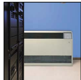
Liebert DataMate Wall Mount System