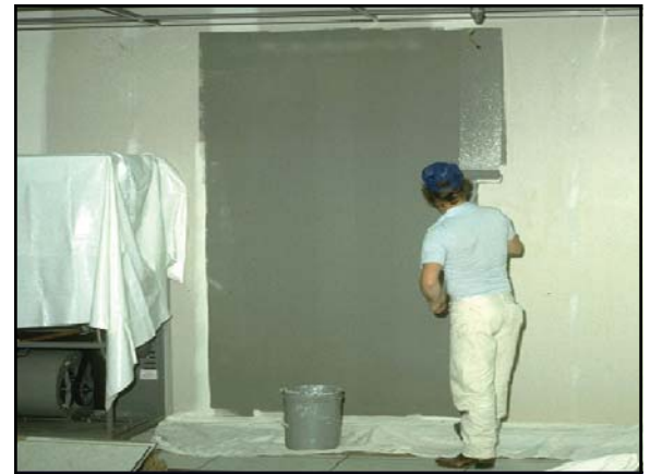
Vapor Retardant Paint for Vapor Barriers

Once the space has been properly isolated, the next step is to select the proper HVAC equipment that will provide the environmental control. Previously we discussed the need for control of temperature AND humidity for these sensitive applications. Effective management of both of these variables demands a higher level of precision performance than a comfort cooling system can offer. Comfort cooling systems are not designed to maintain a precise temperature or humidity band, and are nearly always operating based on a temperature set point - not a humidity set point. Therefore, humidity levels can vary significantly without action by the cooling equipment. Plus, comfort cooling systems are designed for seasonal use only. This means in the winter, the cooling system will either not be operating, or will likely not be operating very reliably. The solution: A precision cooling system designed for year round use in all ambient outdoor conditions. Below are a few significant benefits of Liebert precision cooling systems when applied in one of these unique applications.