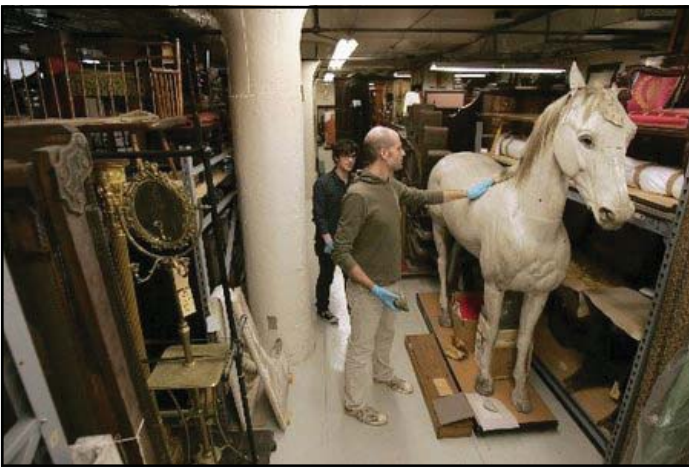
Artifact Storage Areas

300,000 volumes, and many books throughout the collection were affected. The staff attributed the problem to humidity fluctuations in the space, providing an ideal environment for mold to grow. To correct the problem, the library employed a vendor to clean the affected collection, the entire HVAC system, and the interior of the space. They then had to look at ways to improve the environmental control of the space, so as to avoid future out-breaks.