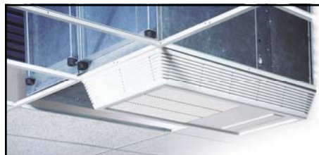
Liebert MiniMate Ceiling Mount System

http://www.liebert.com/product_pages/MainCategory.aspx?id=4